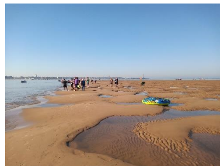
Trip to Newcombe Sands