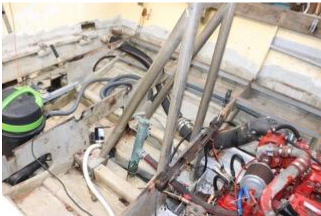
Stripped out and below new floor timbers ready to receive the new floor.